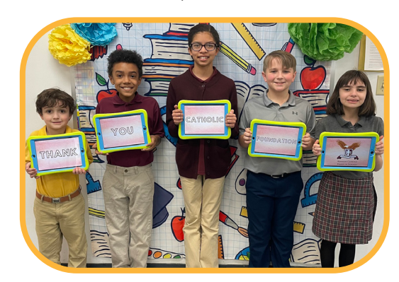
Students at Saint John Paul II Elementary School in Hermitage thanked the Catholic Foundation using some of the iPads that were purchased with a grant from the Education Endowment.