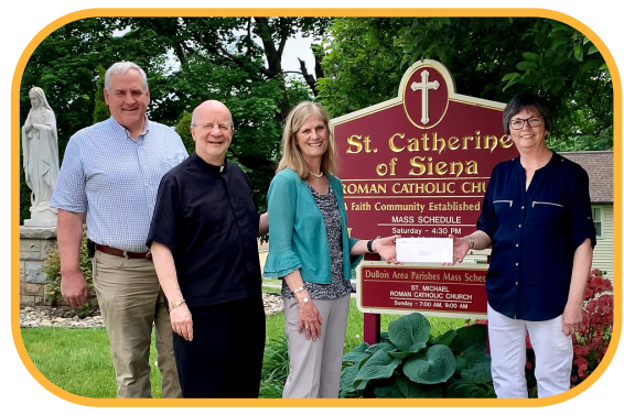
An Education grant provided Saint Catherine of Siena and Saint Michael the Archangel parishes in DuBois with funds for upgraded technology to assist in keeping their faith community connected through Zoom meetings, classes and livestreamed liturgies during the pandemic.