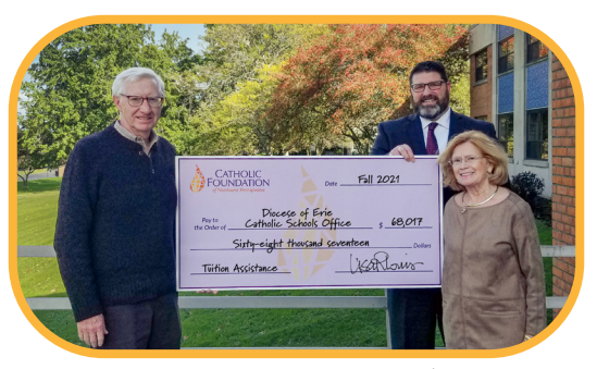
The Catholic Schools Office distributed $68,017 in tuition assistance to students throughout the diocese thanks to a grant from the Education Endowment.