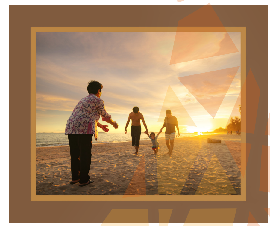
Give a gift that lasts beyond your lifetime.

Call us to discuss your options: (814) 824-1237